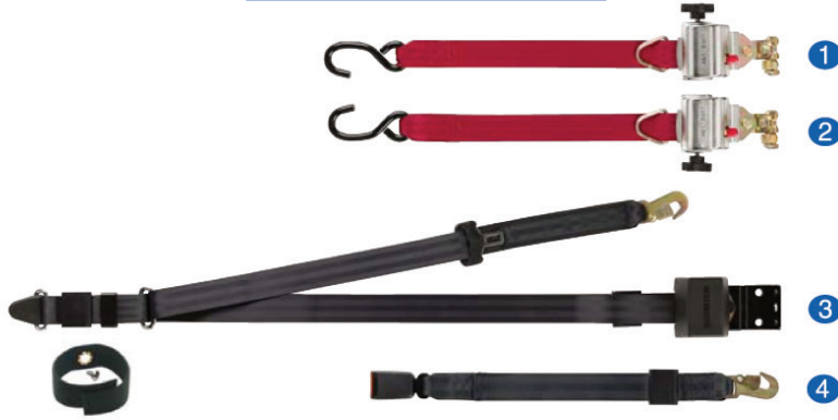
Kit No. FF612S-4C