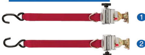
Kit No. FF628S-4C