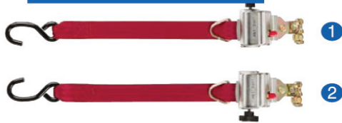
Kit No. FF627S-4C