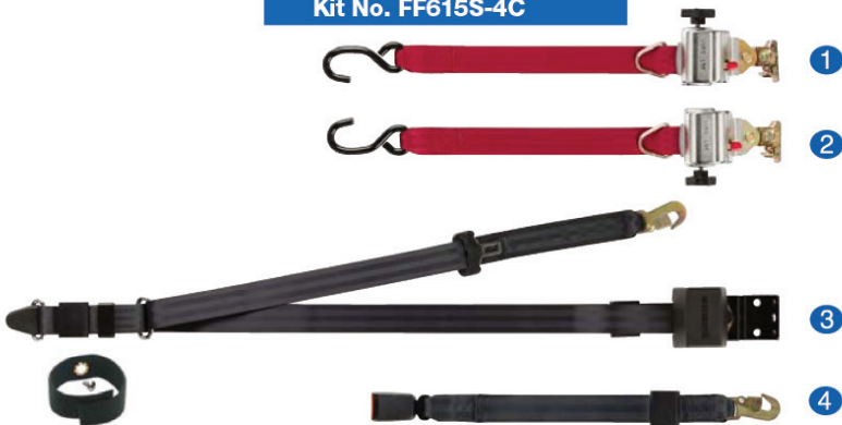
Kit No. FF615S-4C