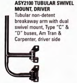
AS2100 TUBULAR SWIVEL MOUNT, DRIVER Tubular non-detent breakaway arm with dual swivel mount, Type "C" & "D" buses, Am Tran & Carpenter, driver side