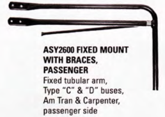
AS2600 FIXED MOUNT WITH BRACES, PASSENGER Fixed tubular arm, Type "C" & "D" buses, Am Tran & Carpenter, passenger side