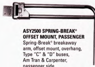
AS2500 SPRING-BREAK® OFFSET MOUNT, PASSENGER Spring-Break® breakaway arm, offset mount, overhang, Type "C" & "D" buses, Am Tran & Carpenter, passenger side