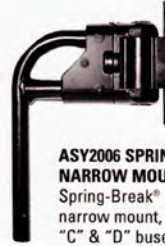
AS2006 SPRING-BREAK® NARROW MOUNT, DRIVER Spring-Break® breakaway arm, narrow mount, overhang, Type "C" & "D" buses, Blue Bird, driver side