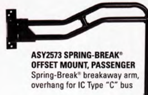
AS2573 SPRING-BREAK® OFFSET MOUNT, PASSENGER Spring-Break® breakaway arm, overhang for IC Type "C" bus