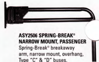
AS2506 SPRING-BREAK® NARROW MOUNT, PASSENGER Spring-Break® breakaway arm, narrow mount, overhang, Type "C" & "D" buses, Blue Bird, passenger side