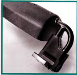
All wiring is hidden inside mirror and arm for aerodynamic styling and functionality