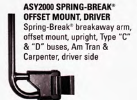
AS2000 SPRING-BREAK® OFFSET MOUNT, DRIVER Spring-Break® breakaway arm, offset mount, upright, Type "C" & "D" buses, Am Tran & Carpenter, driver side