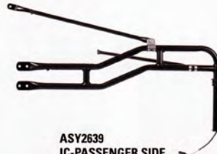
AS2639 IC-PASSENGER SIDE Fixed mount with braces