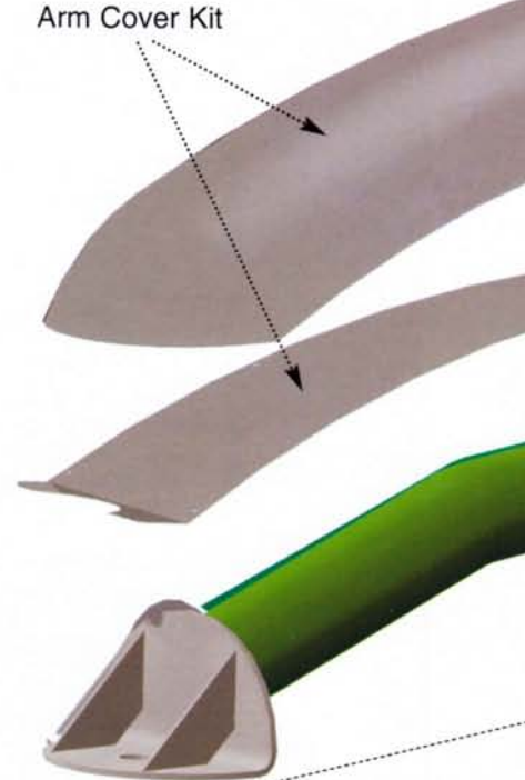
Arm Cover Kit