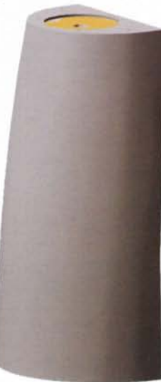
Convex Carrier Assembly (Motorized or Hand-adjustable)