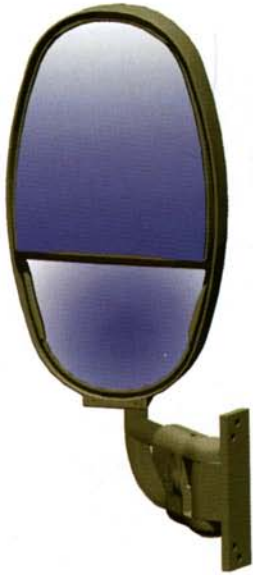
AviaStyle® driver side, upright mirror with Spring-Break® breakaway arm assembly.

The Rosco AviaStyle® mirror system is the standard system on Blue Bird buses.