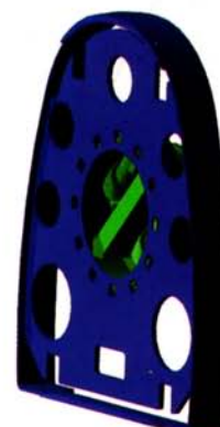
Flat Carrier Assembly. Motorized or Hand-Adjustable.