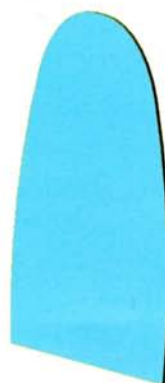
Flat Glass. Heated or Unheated.