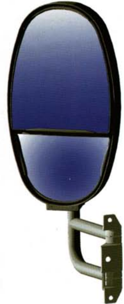
AviaStyle® driver side, upright mirror with non-detent, breakaway arm assembly.