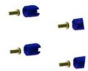
Mirror Housing Mounting Hardware Kit.