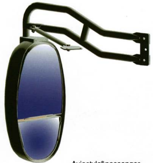
AviaStyle® passenger side, overhang mirror with fixed, overhang assembly.