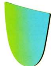
Convex Glass. Heated or Unheated.