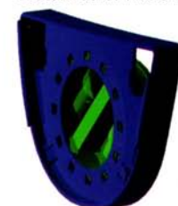
Convex Carrier Assembly. Motorized or Hand-Adjustable.