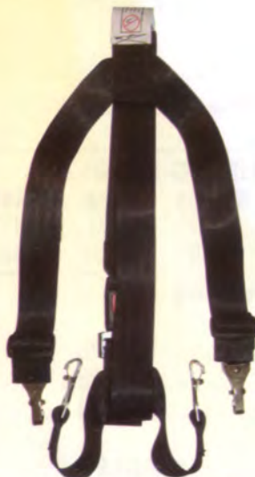
E-Z-ON® Seat Mount