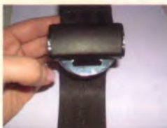
Tilt lock adjusters makes it easy to fit any size.