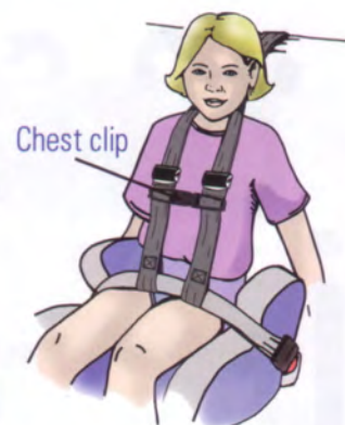
Passengers must use existing crotch straps to meet NHTSA guidelines.