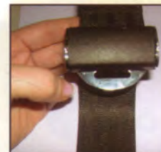
Lift up on tilt-lock to adjust tether