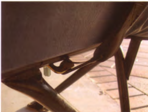
Tether attaches under bus seat, using seat belt hardware or E-Z-ON® hardware