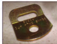
Tether bracket (swivel) included