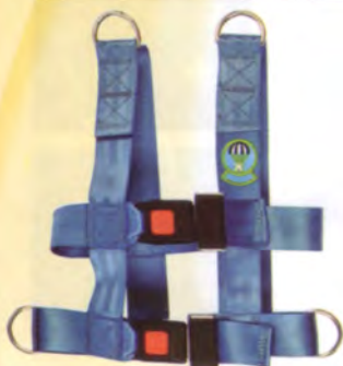
S-M Vests Standard Push Button